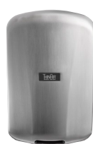
TA-SB Brushed Stainless Steel