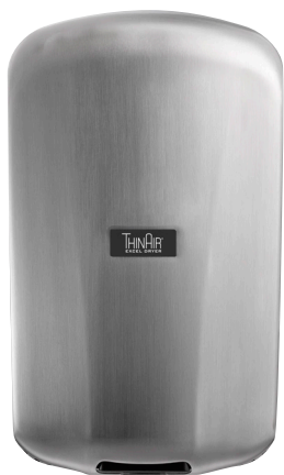
TA-SB Brushed Stainless Steel

MODELS: TA - ABS SB -VOLTAGE (See Chart)