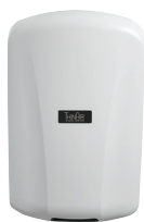
TA-ABS White Polymer (ABS)